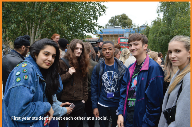
First year students meet each other at a social