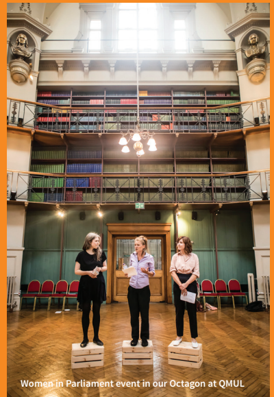
Women in Parliament event in our Octagon at QMUL