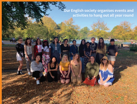
Our English society organises events and activities to hang out all year round